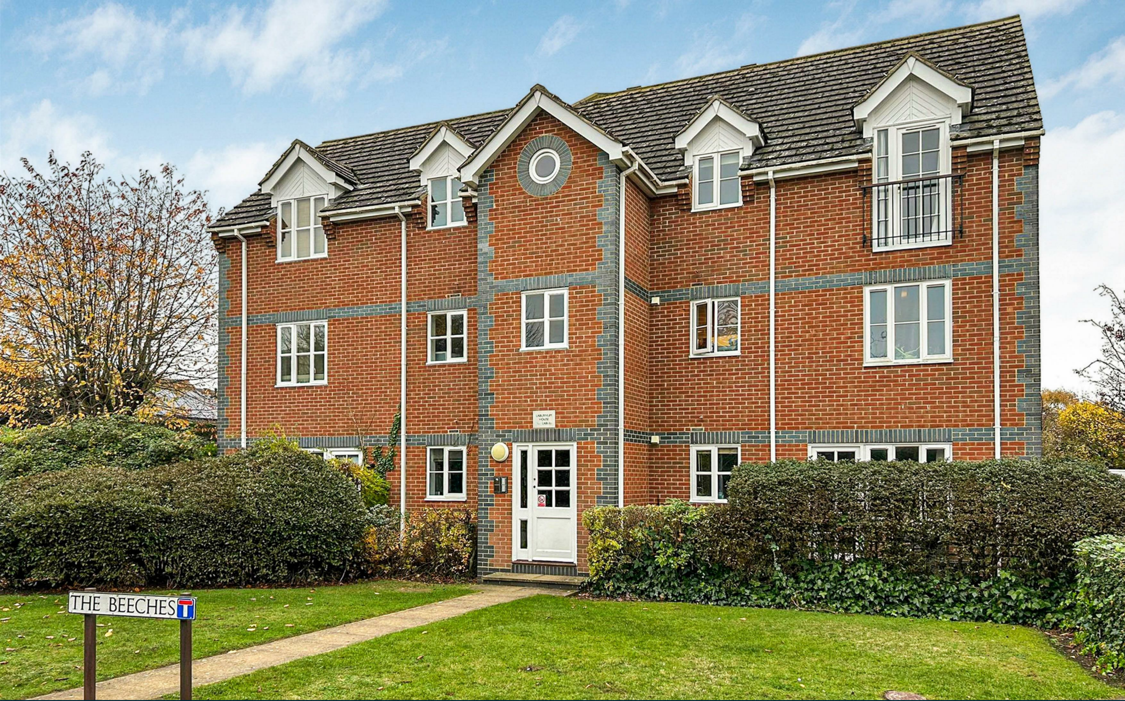
Laburnum House, Cambridge, CB4 1FY